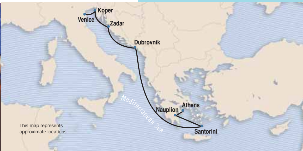
This map represents approximate locations.

All itineraries are current at time of printing and subject to change without notice. ©2008 Celebrity Cruises Inc.