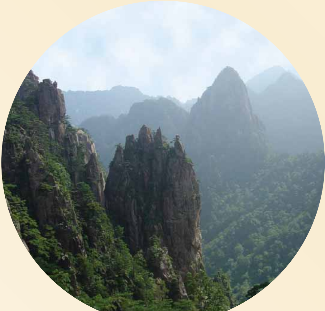
Along the Yangtze River

Return to the airport for flights back to the U.S. arriving on the same day. (B)